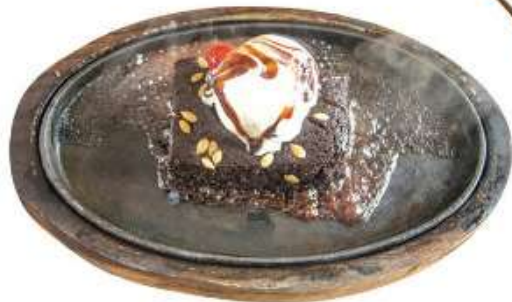
Hot Sizzling Brownie with ice cream 545