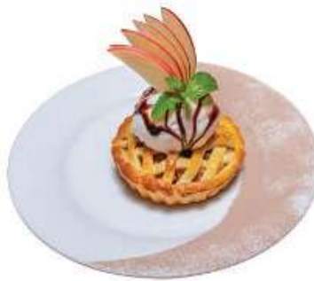
Apple Pie with ice cream 545