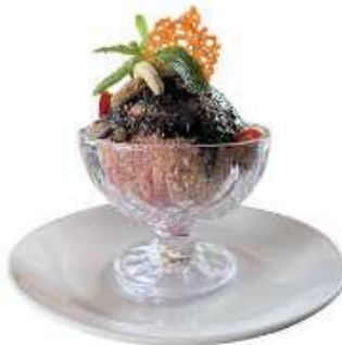
Fried Ice Cream 365