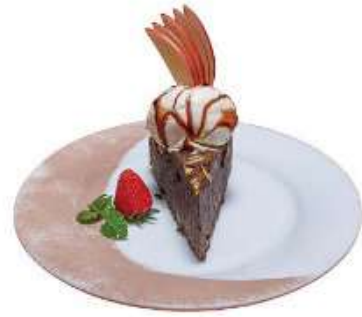
Almond Chocolate Cake with ice cream 545