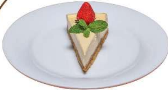
New York Style Cheese Cake 545